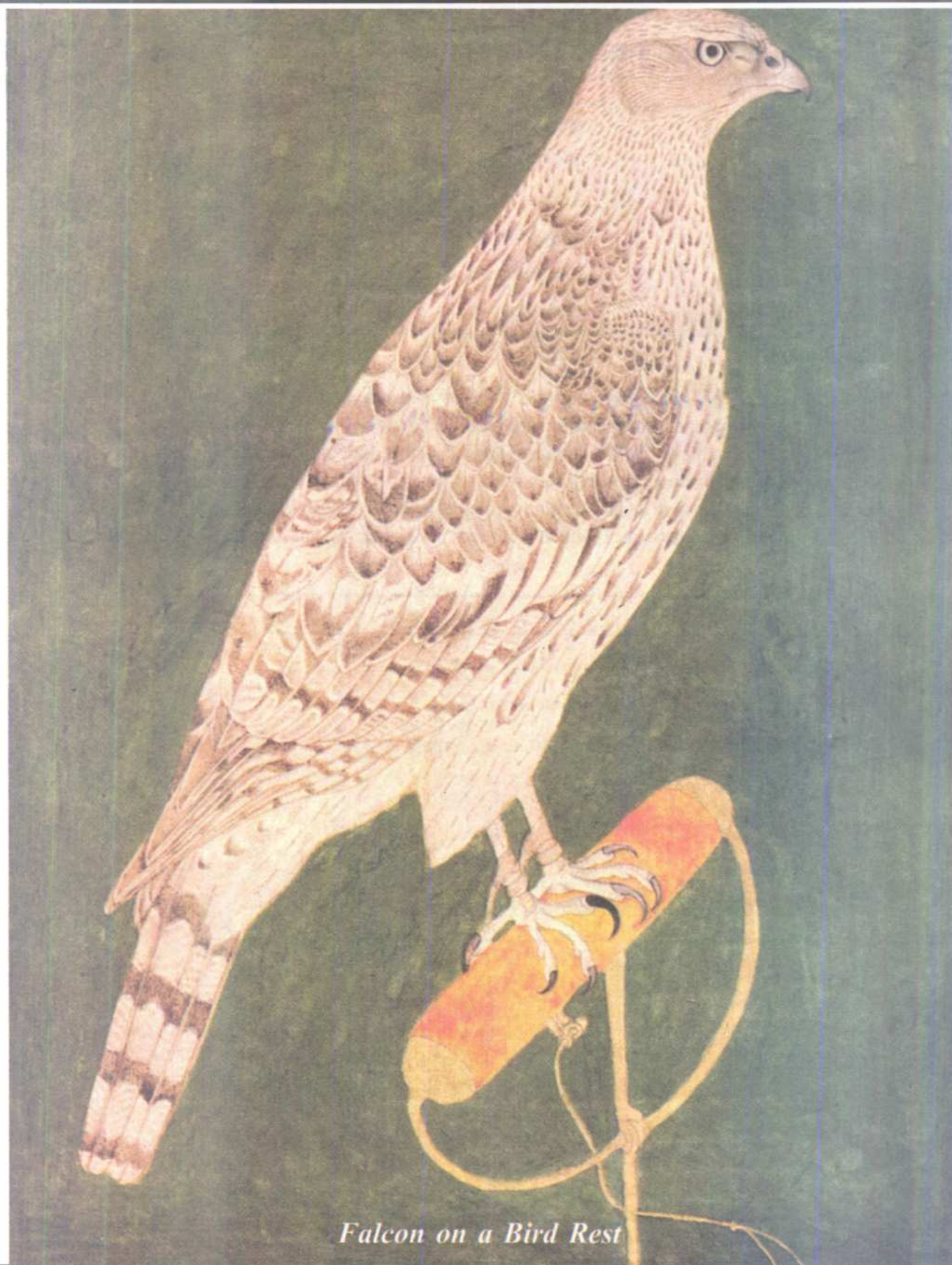
Falcon on a Bird Rest