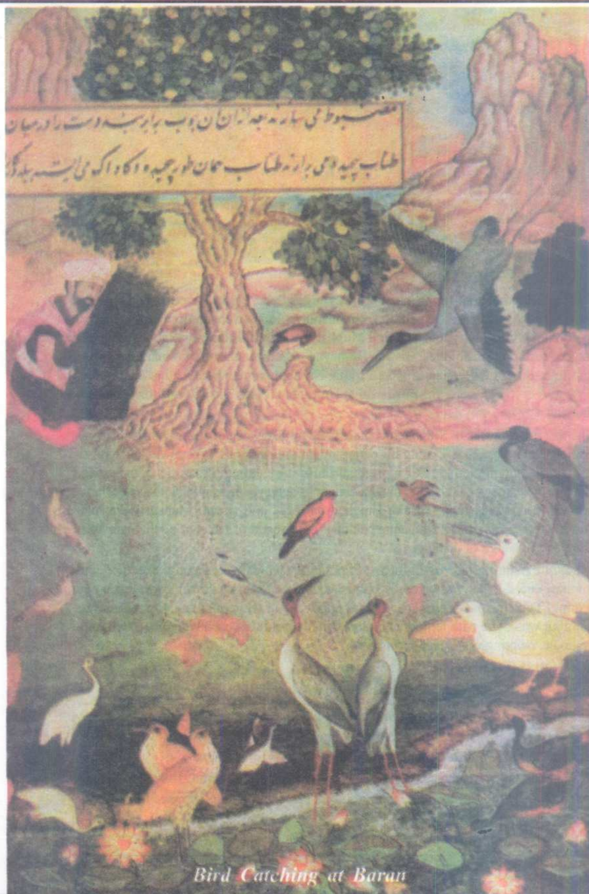
Bird Catching at Baran